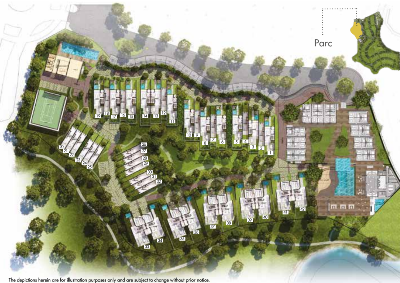
Parc Site Development Plan