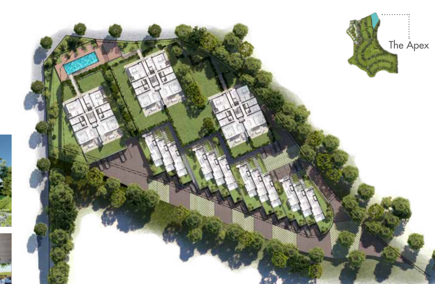
The Apex Site Development Plan