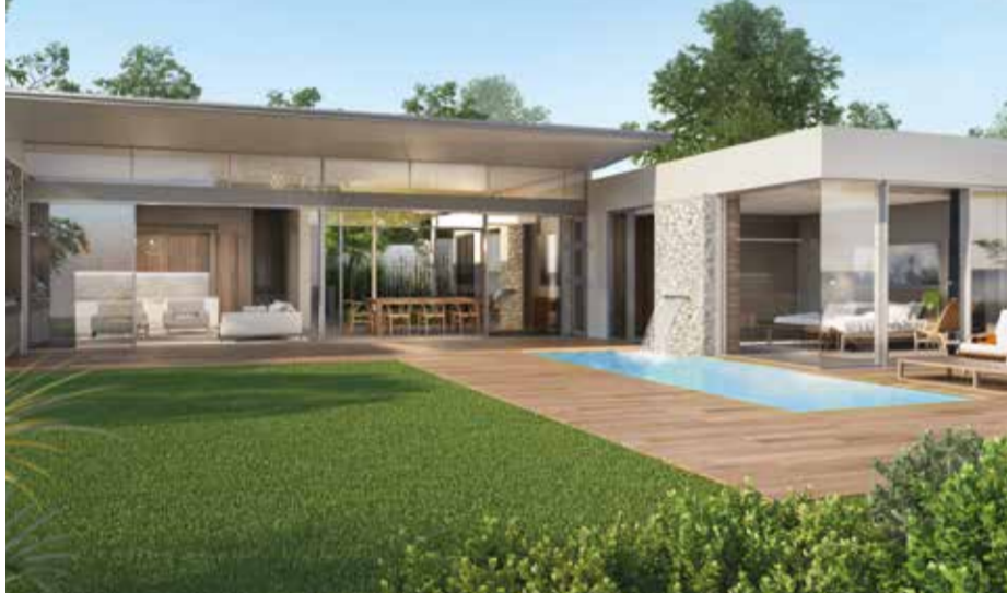
HOUSE TYPE 2 - ORISSA 4 bed | 3 bath | From 269.72m 2